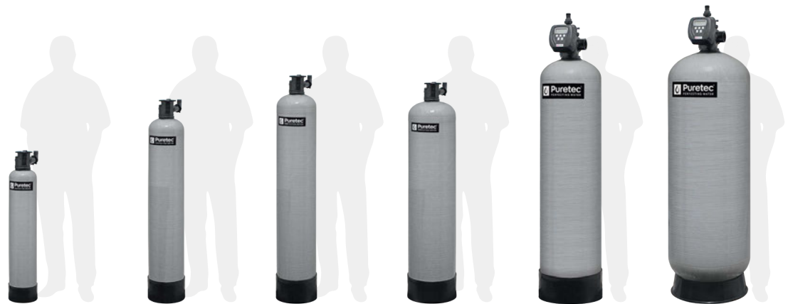
NTS1000 In/out head, 15 Lpm, 25mm connection